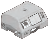
Air Particle Counters

Our Device Agents are Certified to Harmonize Data Into Any LIMS or MES System