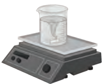
Wireless Sensing Hot Plate Stirrers